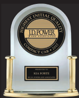
2017 FORTE "Highest Ranked Compact Car in Initial Quality in the U.S."

BASE ENGINE: 2.4L GDI 4-CYLINDER AVAILABLE ENGINE: 2.0L TURBO GDI