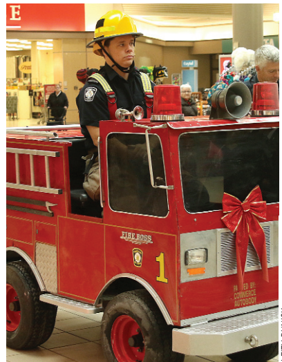
TRADITION: The Thunder Bay Professional Firefighters are behind Toys for Tots again.