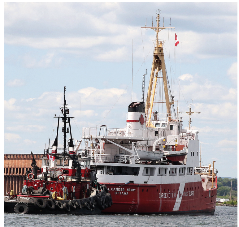
SHIP TO SHORE: The Alexander Henry is towed into the city this past June.