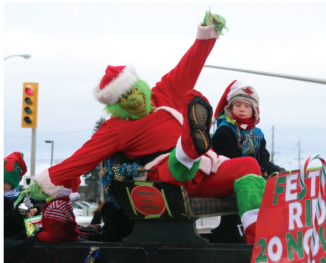
GRINCH AND BEAR IT: Despite his anti-Christmas origins, the Grinch was welcomed at last week's Santa Claus parade.