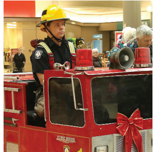
Firefighters launch annual Toys for Tots /9