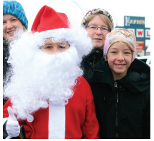
Annual Santa Claus parade draws crowds /16