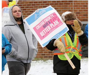
Province legislates college teachers back to work /3