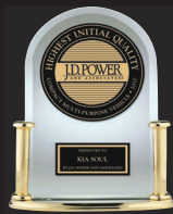
2017 SOUL "Highest Ranked Compact Multi-Purpose Vehicle in Initial Quality, 3 Years in a Row in the U.S."

BASE ENGINE: 2.4L GDI 4-CYLINDER AVAILABLE ENGINES: 2.0L TURBO GDI, 3.3L V6