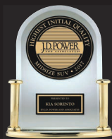
2017 SORENTO "Highest Ranked Midsize SUV in Initial Quality, 2 out of 3 Years in the U.S."

NO CHARGE WINTER TIRES † ON SELECT MODELS