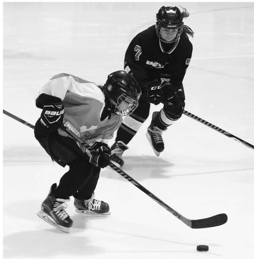
ON ICE: The Chill tournament wrapped up on Sunday and saw 33 teams from across the region.